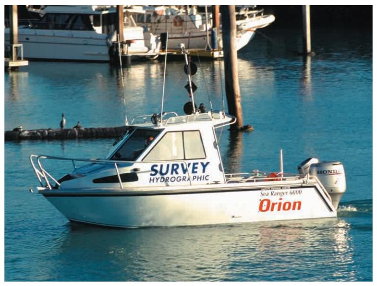
Systems for inland waterway, coastal, and offshore marine surveying.

The software's flexible operation provides multiple 'steerby' capability, allowing guidance of multiple vessels and offsets to multiple guidance objects such as targets, lines, or routes. Guidance between mobile vessels is