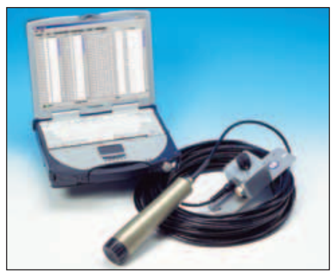
E-Sea Tide and a laptop