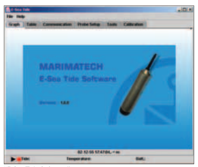
"E-Sea Tide Software"